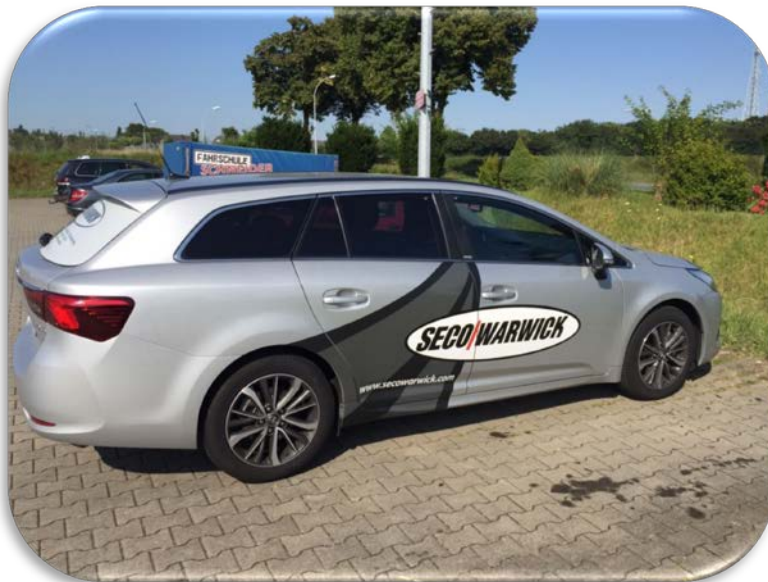
SECO/WARWICK GmbH Bedburg-Hau Germany

2,0-I-D-4D 105kW (143PS) year Juni 2016.